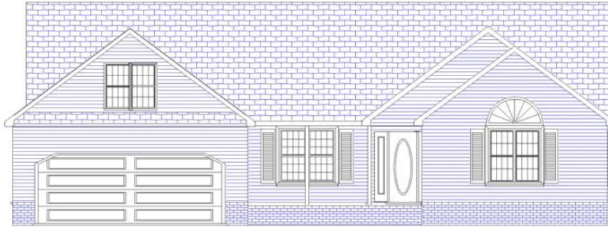
"THE STAPLETON III" 4 BEDRM W/BONUS 2150 SQ. FT.